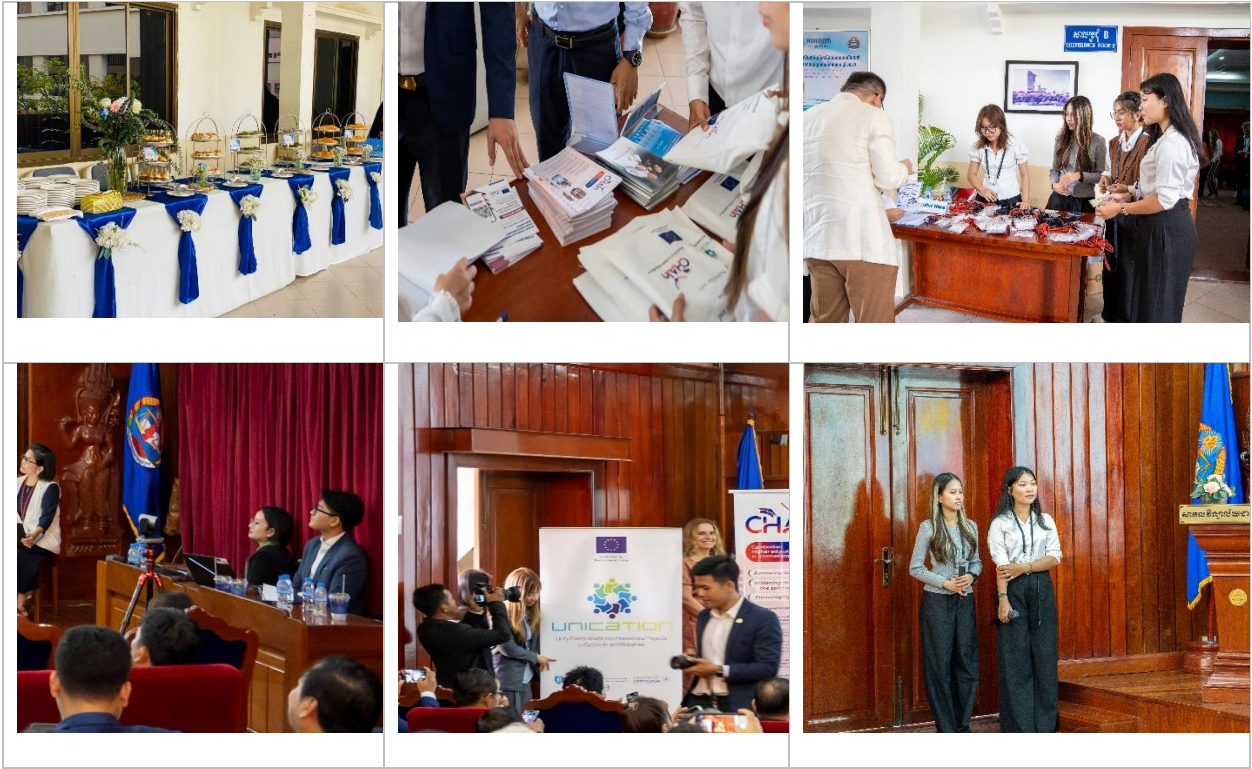
Hall, technical equipment, media, Refreshment for two days, operational Staffing