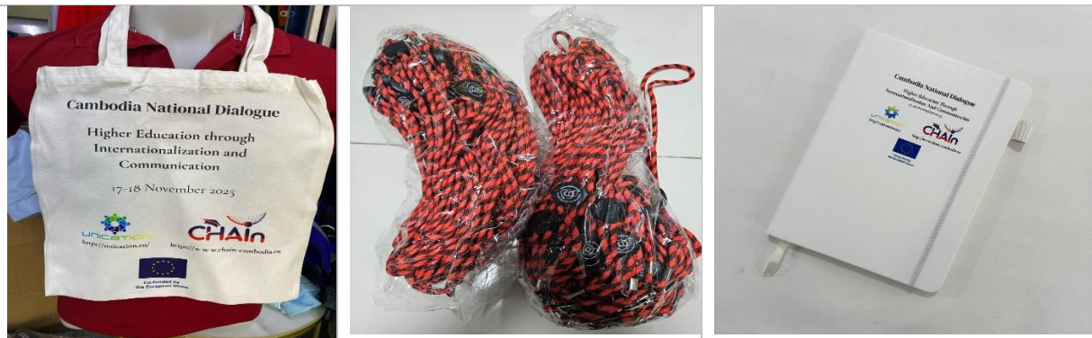
Material contributions for participants